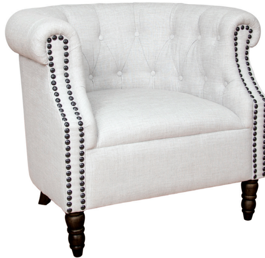
Body Fabric: Kaslo Grey