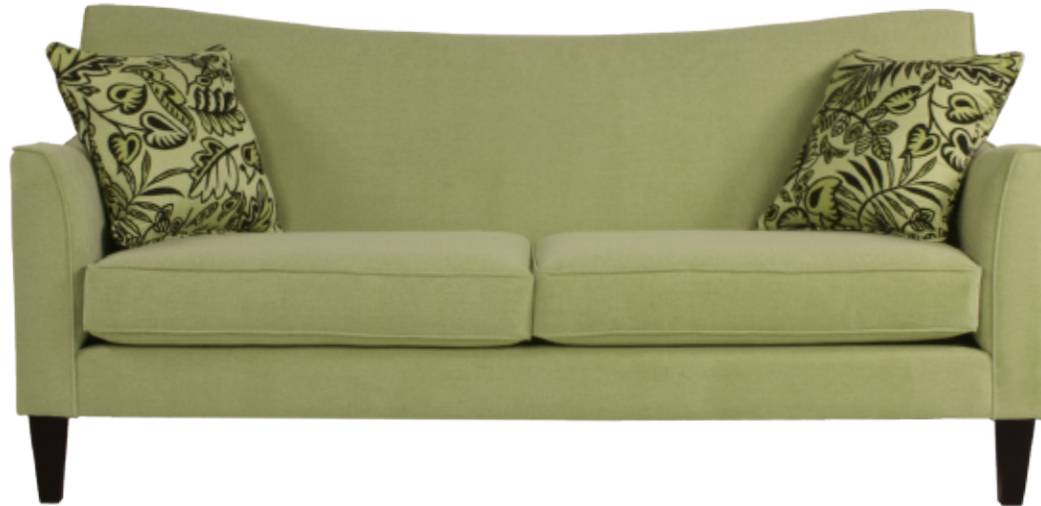
Body Fabric: Richmond Camelot