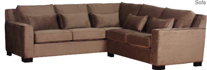
Body Fabric: Renegade Grail Toss Pillow Fabric: Renegade Grail